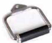
Deluxe Stirrup Chrome Handle PU Grip ATT-SINGLE