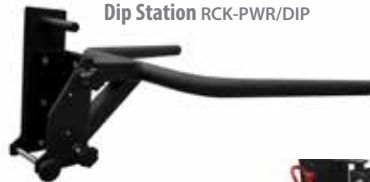
Dip Station RCK-PWR/DIP