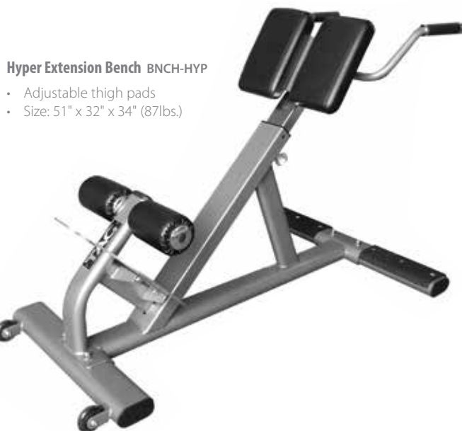
Hyper Extension Bench BNCH-HYP