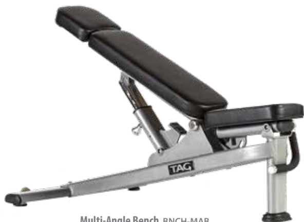
Multi-Angle Bench BNCH-MAB