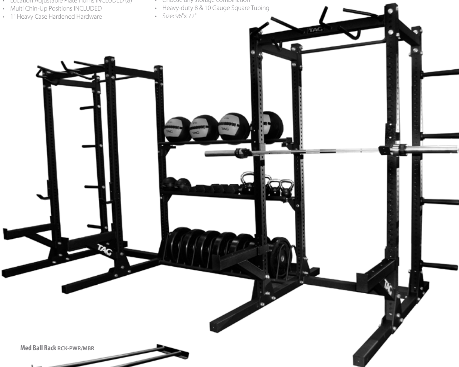
Med Ball Rack RCK-PWR/MBR