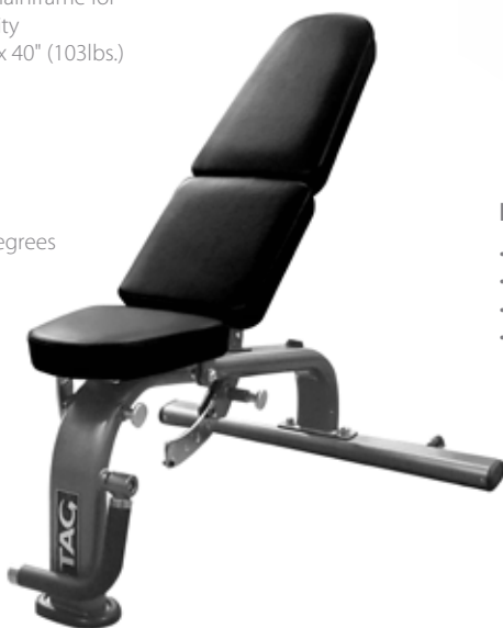
FID Bench BNCH-FID-B