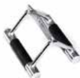
Seated Row/Chinning Chrome Bar PU Grip ATT-ROW/TRAINING